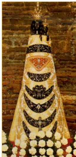
MARY OF LORETO

TODAY IS THE PETER'S PENCE COLLECTION, A WORLDWIDE COLLECTION THAT SUPPORTS THE CHARITABLE WORKS OF POPE FRANCIS. FUNDS FROM THIS COLLECTION HELP VICTIMS OF WAR, OPPRESSION, AND NATURAL DISASTERS. TAKE THIS OPPORTUNITY TO JOIN WITH POPE FRANCIS AND BE A WITNESS OF CHARITY TO OUR SUFFERING BROTHERS AND SISTERS. PLEASE BE GENEROUS TODAY. FOR MORE INFORMATION, VISIT WWW.USCCB.ORG/PETERS-PENCE .